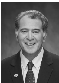
BRICKWOOD GALUTERIA 12th Senatorial District Majority Caucus Leader