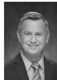
GIL RIVIERE 23rd Senatorial District