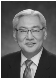
LES IHARA, JR. 10th Senatorial District