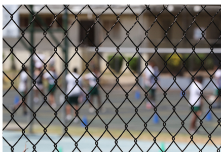
Mental health and suicide prevention efforts need to start sooner for middle school students like these in a recent PE class in Honolulu, according to the state's Youth Leadership Council for Suicide Prevention.