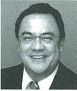
Pono Cong Majority Whip