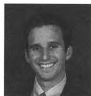
BRIAN SCHATZ Asst. Majority Floor Leader