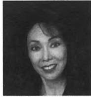
LEI AHU ISA