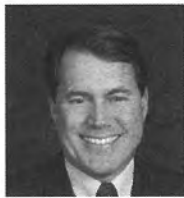
ED CASE Majority Leader