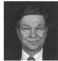
GALEN FOX Minority Whip