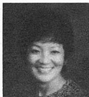
MAZIE K. HIRONO Chairman Consumer Protection and Commerce