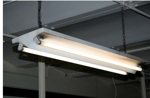
Figure 1. General-purpose, white light fluorescent light bulbs.

LEDs have advanced tremendously over the last 10 years. Our lighting market research found that today LEDs are widely available and cost effective as replacements for general-purpose, white light fluorescent light bulbs across the different sizes and shapes. General-purpose, white light bulbs are most commonly found in office building settings or in certain residential situations like a kitchen or basement (see Figure 1). LEDs were found to produce the same or better light quality, last 2-3 times longer, have positive economic outcomes for consumers, and not contain mercury compared to their general-purpose fluorescent counterpart. SB 690 only proposes to transition out these types of fluorescents and would not cover specialty fluorescents, such as ultraviolet (UV) fluorescents used for tanning booths or other specialty purposes.