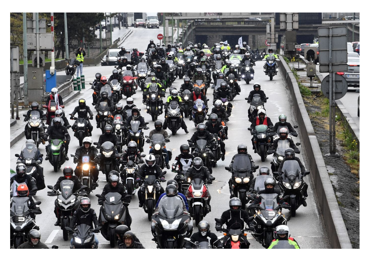
Motorcyclists ride along the périphérique around Paris in April 2021 as they stage a protest against new parking regulations for motorcycles.

But these noise-canceling efforts have also drawn some resistance – especially from motorcycle owners, who staged raucous mass protest rides through Paris in 2021 to protest new parking charges, speed limits and other measures.