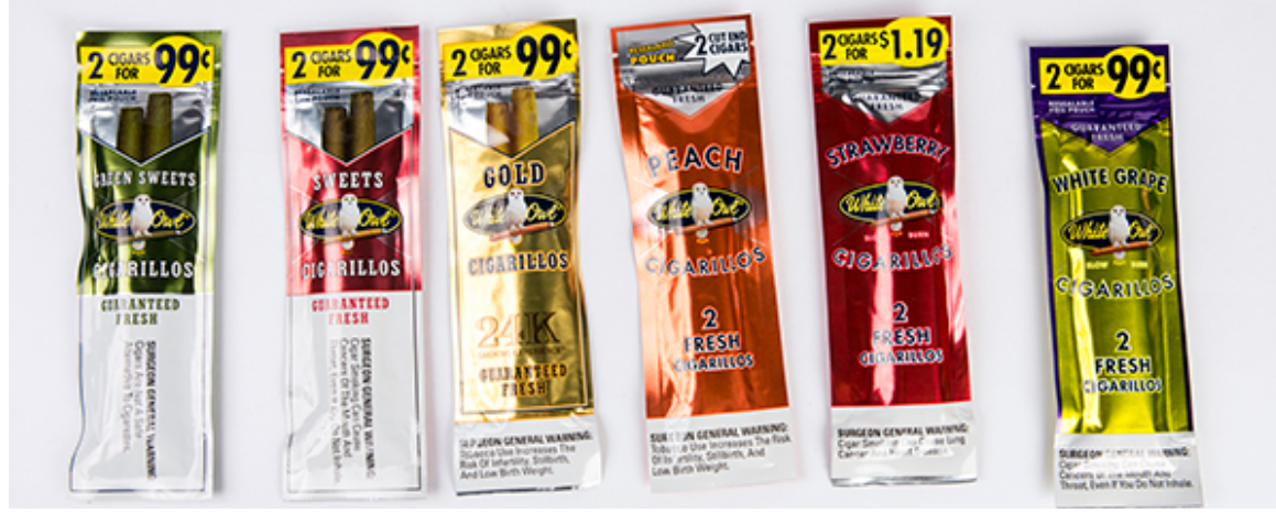
Example of cheap flavored cigars.

It is imperative that the flavor menthol , as well as all tobacco products, be addressed by this bill. Menthol's cooling properties have been exploited by the tobacco industry to mask the harshness of tobacco smoke and for decades, and the tobacco industry has profited from using menthol in its targeting of youth of color and other marginalized and low-income populations. African Americans, Native Hawaiians, and Filipinos are disproportionately affected by the harms caused by tobacco. Including <u>all tobacco products</u> in any law ending the sale of flavored tobacco products is important, as flavored cigars and menthol combustible cigarettes remain popular and reversing the youth vaping epidemic requires ending the sale of tobacco products that could serve as a replacement for youth once flavored e-cigarettes are no longer available . In Hawai'i, over half of youth smokers<sup>ix</sup> and 78% percent of Native Hawaiians and Pacific Islanders who smoke use menthol cigarettes.<sup>×</sup> Menthol is also one of the most popular flavors among high school e-cigarette users<sup>[xiv]</sup>, especially as e-cigarette companies will often create hybrid flavors, combining menthol with fruit flavors to create flavors such as "strawberry freeze" and "watermelon ice." There is great concern that youth could merely "switch" to the familiar taste of menthol cigarettes once their preferred mentholated e-cigarettes are unavailable.