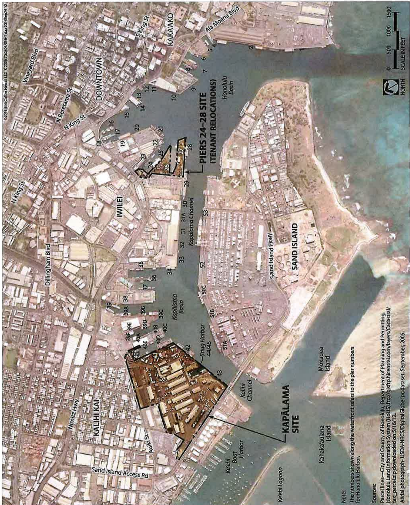
Figure 1-1. Honolulu Harbor, O'ahu