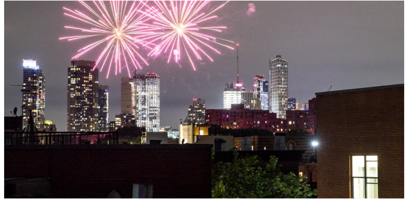
FILE – In this Friday, June 19, 2020 photo, fireworks explode during Juneteenth celebrations above the Bedford-Stuyvesant neighborhood in the Brooklyn borough of New York. The Manhattan skyline is seen in the background. They light up the sky in celebration, best known in the U.S. as a way to highlight Independence Day. This year, fireworks aren't being saved for special events. They've become a nightly nuisance from Connecticut to California, angering sleep-deprived citizens and alarming local officials.