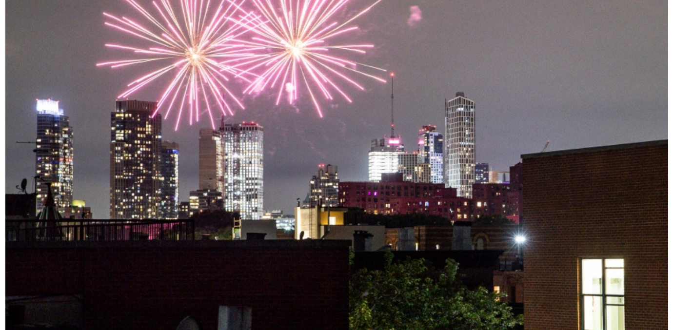
FILE – In this Friday, June 19, 2020 photo, fireworks explode during Juneteenth celebrations above the Bedford-Stuyvesant neighborhood in the Brooklyn borough of New York. The Manhattan skyline is seen in the background. They light up the sky in celebration, best known in the U.S. as a way to highlight Independence Day. This year, fireworks aren't being saved for special events. They've become a nightly nuisance from Connecticut to California, angering sleep-deprived citizens and alarming local officials.