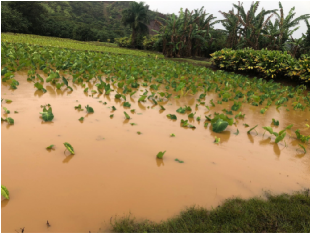
This is my lo'i on 2/19/2021

save our lo'i and overcome the many procedural hurdles to obtain a long-term water lease. Our community is resilient and committed to this work but, we need your kōkua — and the ability to directly negotiate — to continue our efforts in earnest. Please act today to pass these resolutions.