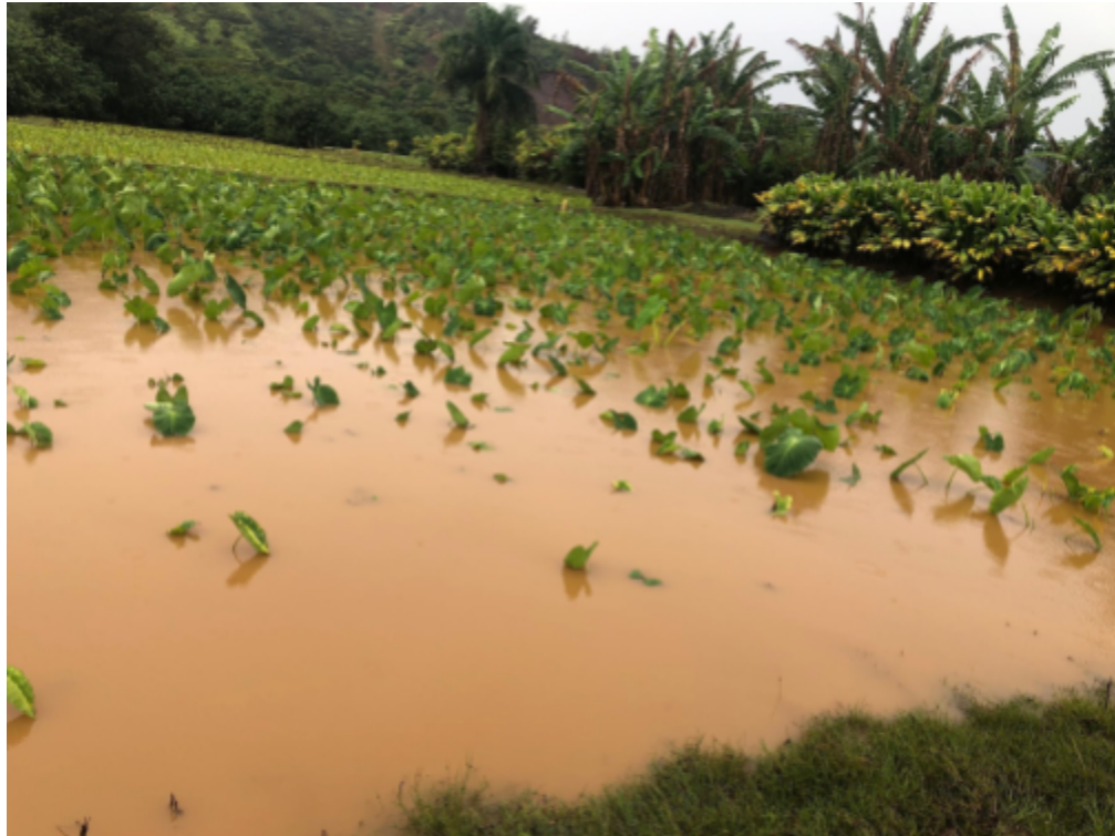
This is my lo'i on 2/19/2021

replanted for the next crop). You may have also heard of the landslide that closed the road into Hanalei. Several weeks ago, I sat in traffic for hours with my family as we tried to get home from my son's baseball game and the traffic has not gotten better since then. We are trying to make due, but it's hard. We need your committee's support more than ever as we try to save our lo'i and overcome the many procedural hurdles to obtain a long-term water lease. Our community is resilient and committed to this work but, we need your kōkua — and the ability to directly negotiate — to continue our efforts in earnest. Please act today to pass this resolution.