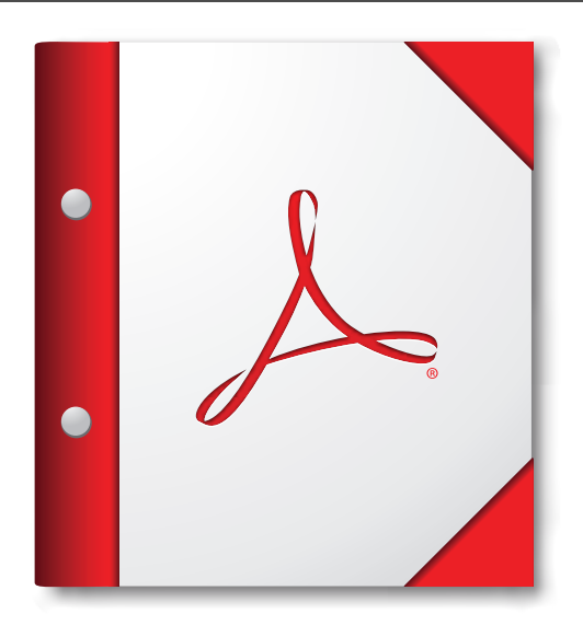
For the best experience, open this PDF portfolio in Acrobat X or Adobe Reader X, or later.