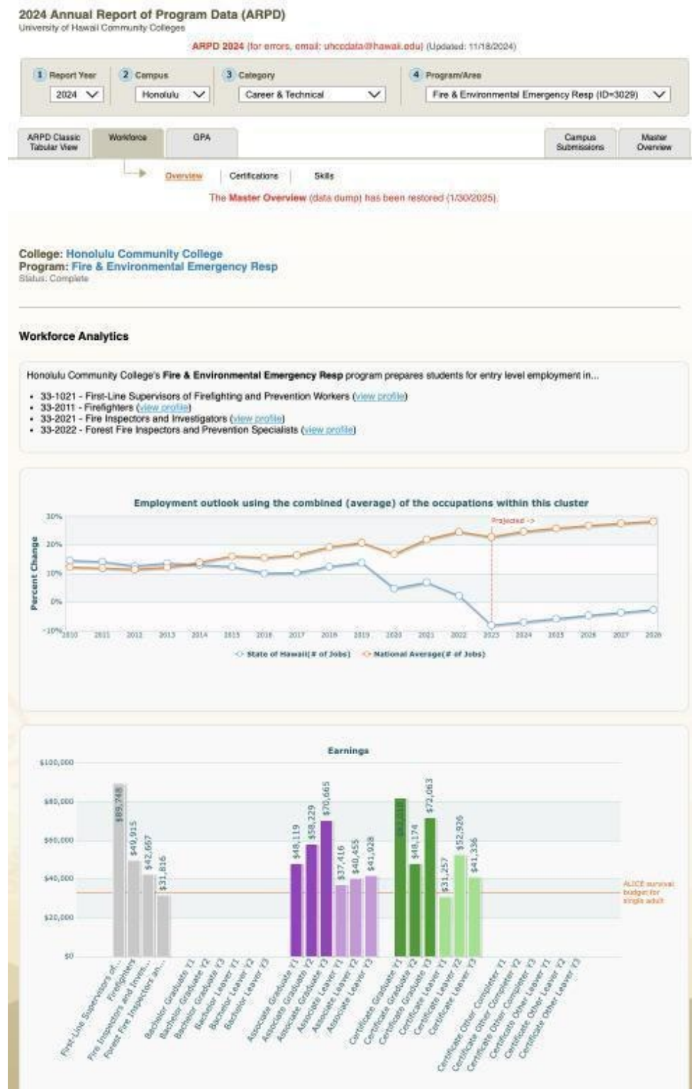
Figure 2: Workforce Tab.

The ARPD is used to evaluate program effectiveness at the college and system level, and the data is integrated for planning and budgeting purposes at each of the community colleges.