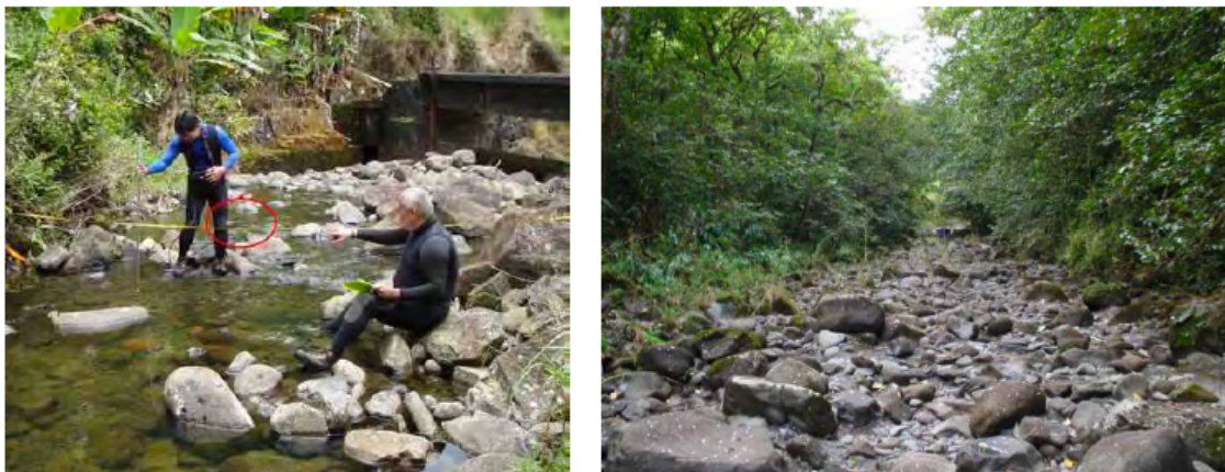
Figure 15. Changes in instream habitat after stream diversion on Honomanū Stream, Maui. The diversion, downstream of the surveyors, was diverting 100% of stream flow (left picture). Downstream of diversion (right picture) there is no water flow and no habitat for aquatic animals.

The diversion of all of a stream’s base flow has obvious significant impacts. But BLNR continued to renew these permits for decades. For years, BLNR renewed these permits in secret – failing to properly notify the public about its decisionmaking. It was only after Nā Moku sued that A&B began working on an environmental impact statement, which was not completed until September 2021. That EIS revealed that the diversions caused the loss of 88.2% of the habitat of some streams. Here are some photographs that depict the damage caused by these permits from a report produced by the Bishop Museum and BLNR’s Division of Aquatic Resources in 2009: