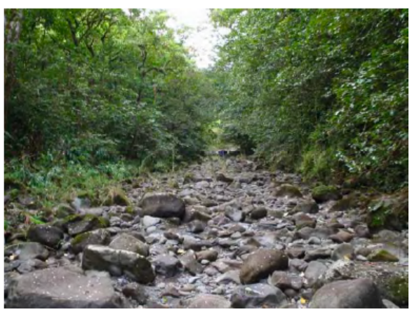
Figure 15. Changes in instream habitat after stream diversion on Honomanū Stream, Maui. The diversion, downstream of the surveyors, was diverting 100% of stream flow (left picture). Downstream of diversion (right picture) there is no water flow and no habitat for aquatic animals.

SB 1074 and HB 661 HD2 would allow BLNR and other agencies to renew permits that may have devastating consequences without considering their impact. Consider the type of activities that continued for decades that never had their impact assessed or considered until very recently: the operation of the fuel tanks at Red Hill; the diversion of streams in East Maui; and the bombing of ceded lands at Pōhakuloa.