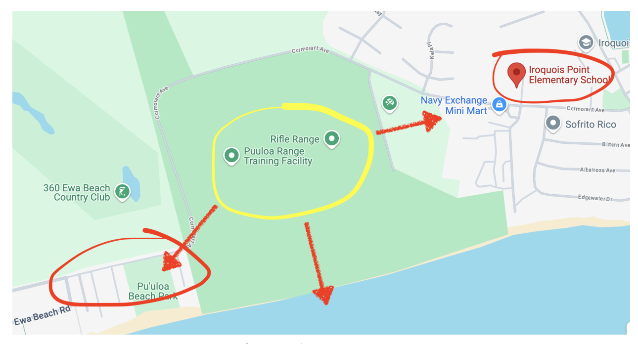
Figure illustrating the proximity of the Pu'uloa Range Training Facility to neighborhoods, an elementary school, a popular community beach park, and public trust waters frequented by surfers, swimmers, and local fishers.

significant, irreversible, and generational harms may be inflicted upon local families and visitors, including infants, children, and pregnant women, who live, attend school, or recreate in the 'Ewa Beach region surrounding the PRTF. Allowing this risk to continue is simply unconscionable.