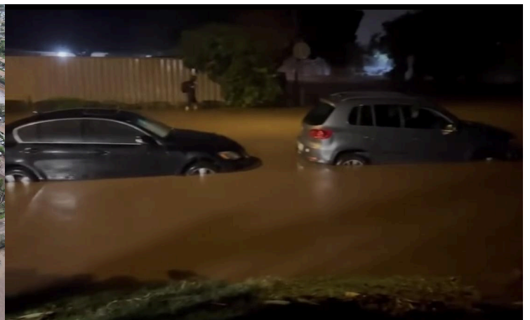
Figures 7 and 8: Flooding of Kūlanihāko'i gulch, and cars floating down the road.