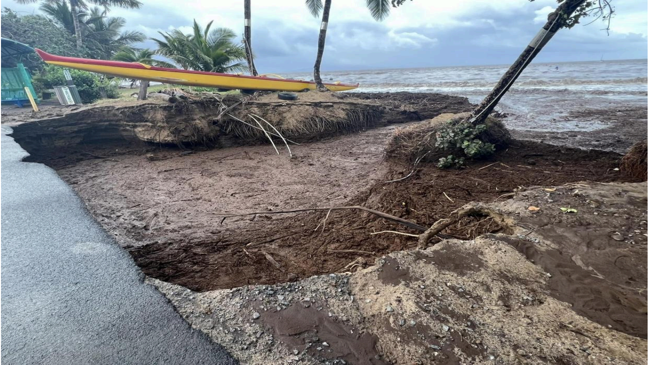
Figure 4: South Kihei Road, flood damage located by canoe club.