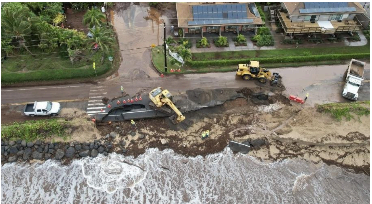
Figures 2 and 3: South Kihei Road a main economic artery, impassable for weeks: One of only 2 ways to access South Maui the largest revenue generating area on Maui. (Photos from flood storm January 2025)