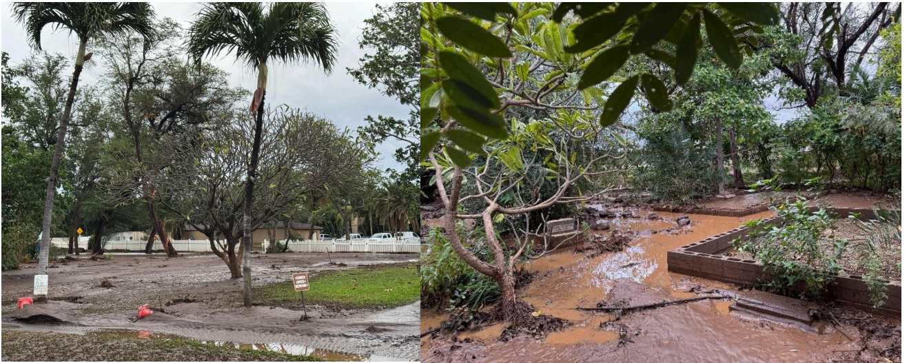
Figures 12,13: The effect of the 1/25 flood on local beach and TMK 3-9-001-012-0000. This historic David Malo Church property is owned by DLNR.

Mahalo for your time and consideration of my request to help South Maui, a primary revenue generator for the state.