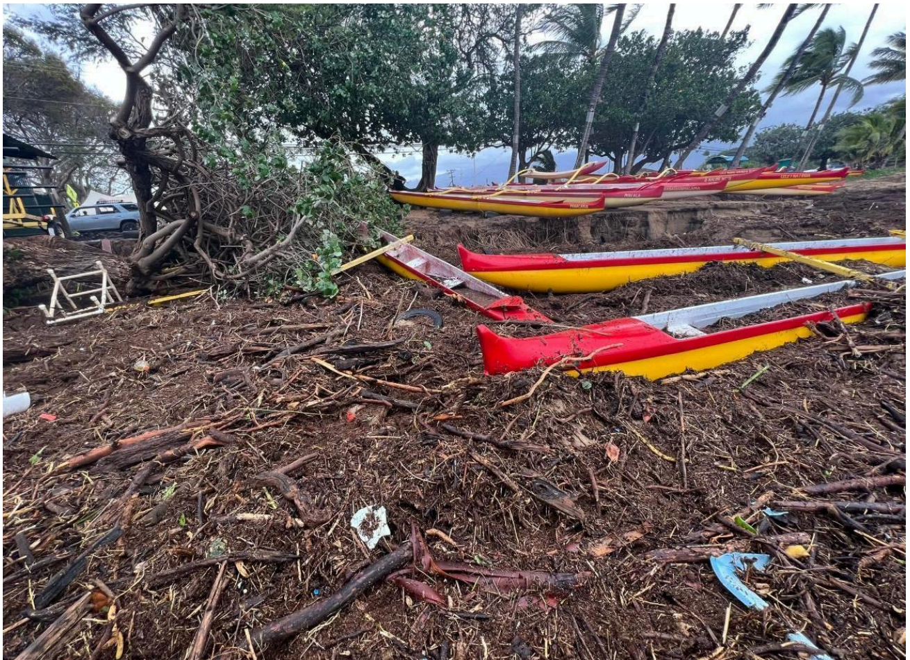
Figure 11: Damage at Kihei Canoe Club