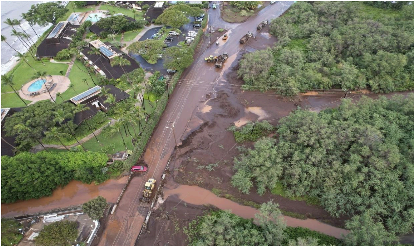
Figure 5: Main Traffic artery South Kihei Road 1/31, typical of many floods.