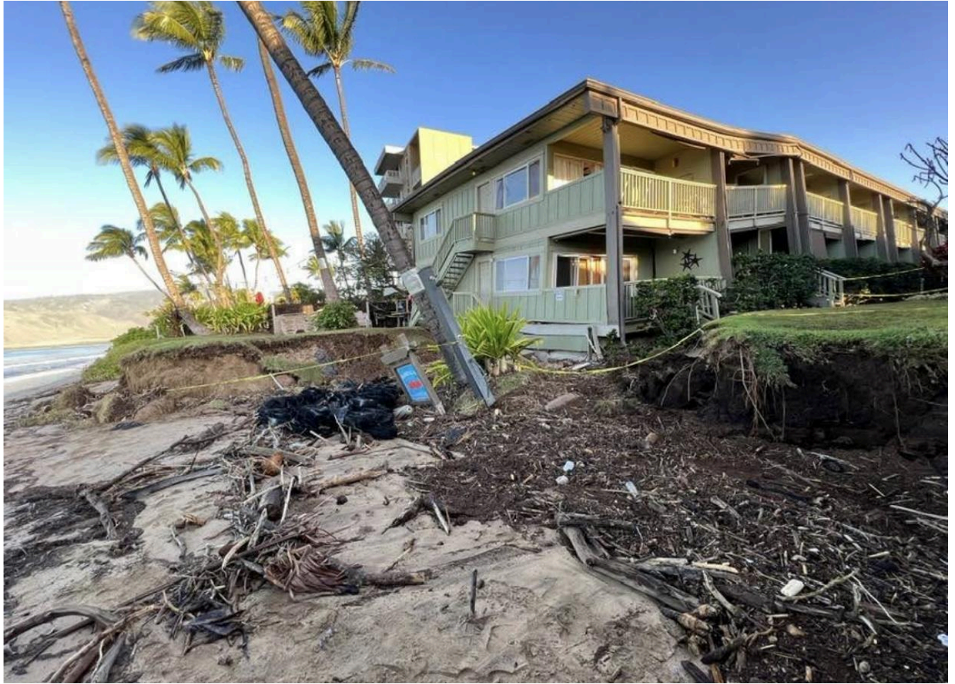
Figure 6: Housing damaged by 1/25 flood, likely this will be condemned.