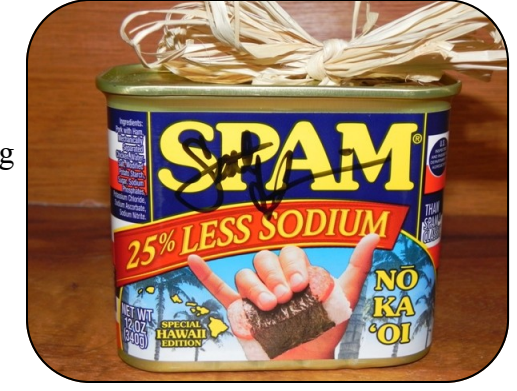
An iconic Hawaii food product, with Scott's label design that includes iconic Hawaii images – the Hawaii flag on the reverse, and an outstretched hand in full shaka position, clutching a perfectly molded SPAM musubi.

Canned spiced ham, more commonly know as SPAM, was widely distributed among military troops in the Pacific and in remote Hawaii during World War II, because fresh meat was in short supply and difficult to preserve. Quick-thinking Island entrepreneurs made sure it would be on Hawaii grocery shelves when troops returned from the battlefield. The popularity of SPAM soared in the 1980s when someone concocted the uniquely island "delicacy" – SPAM musubi – to the extent that Hawaii residents now consume more than 8-million cans of SPAM each year.