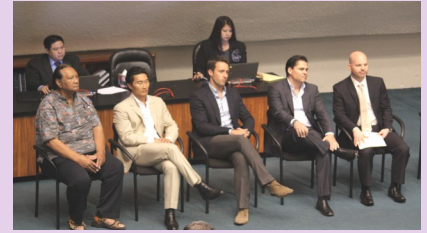
Being Honored in the Senate Floor