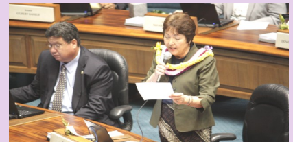
Senator Kidani's Speech