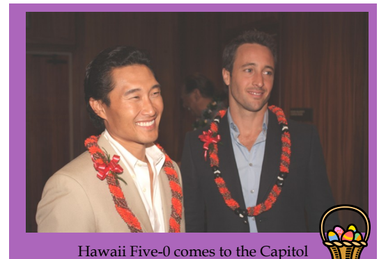
Hawaii Five-0 comes to the Capitol