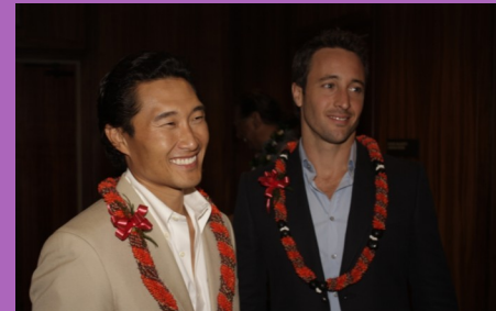
Hawaii Five-0 comes to the Capitol

As we continue to deliberate the budget, we must be mindful of economic, health and safety impacts to our citizens.