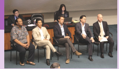
Being Honored in the Senate Floor