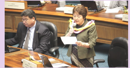
Senator Kidani's Speech