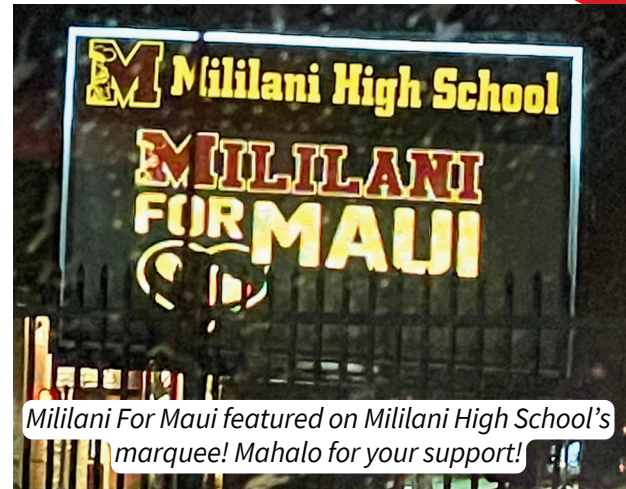
Mililani For Maui featured on Mililani High School's marquee! Mahalo for your support!

I'm grateful to have the honor of representing you in the Legislature. Together, we'll continue to work tirelessly to ensure that the spirit of aloha radiates for the remainder of the year.