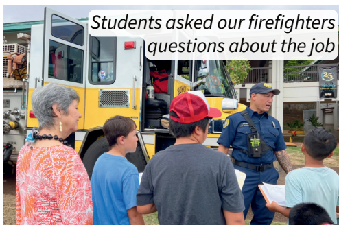
Students asked our firefighters questions about the job