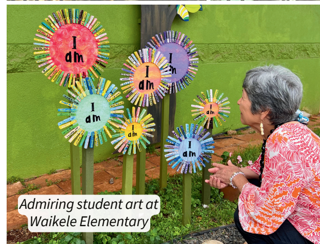
Admiring student art at Waikele Elementary