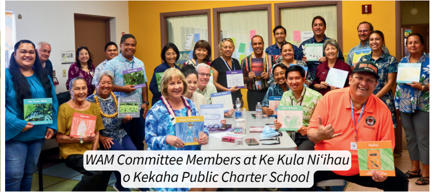
WAM Committee Members at Ke Kula Ni'ihau o Kekaha Public Charter School