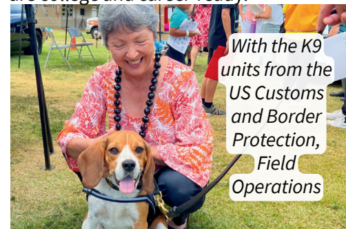
With the K9 units from the US Customs and Border Protection, Field Operations

Early exposure to various career opportunities can play a pivotal role in broadening children’s horizons and help them make informed decisions about future career paths. This program exemplifies our commitment to equipping students with the knowledge and skills necessary for their future, ensuring they are college and career-ready.