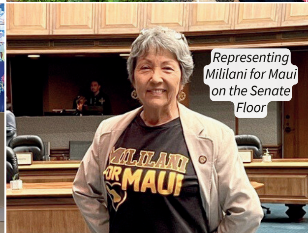
Representing Mililani for Maui on the Senate Floor