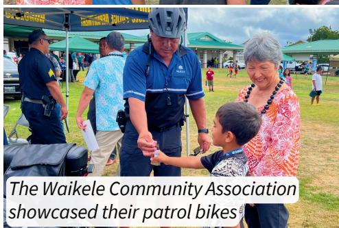
The Waikele Community Association showcased their patrol bikes

Waikele Elementary School recently hosted its 6th annual Career & College Fair, emphasizing the importance of early exposure to various professions for our young students. I was delighted to join the Fair and see our keiki engage with a variety of occupations, such as healthcare professionals, first responders, engineers, arts and communications, and hospitality managers.