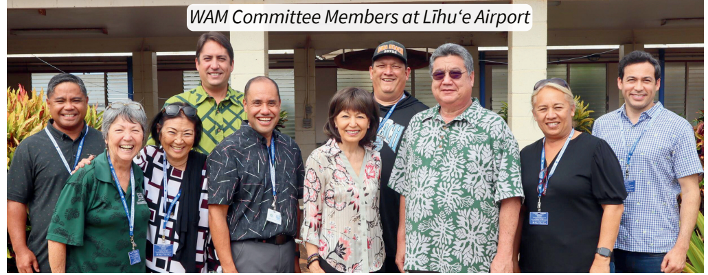
WAM Committee Members at Lihū'e Airport

focused on addressing language access for limited English and 'Ōlelo Hawai'i speakers and visited Kaulu I Ka Pono Academy, observing their support for youth with substance abuse issues and discussing plans to expand alternative learning programs statewide.