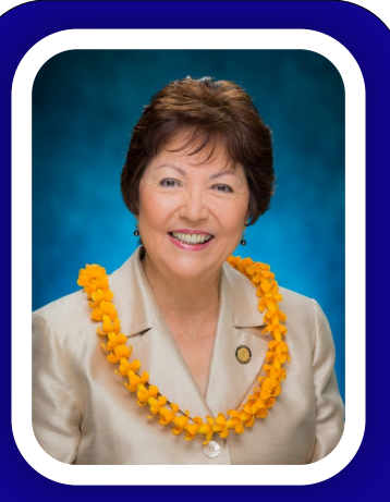
Senate Vice President

(D) Senate District 18 - Serving Mililani Town, Waipio Gentry, Waikele, Village Park, Royal Kunia