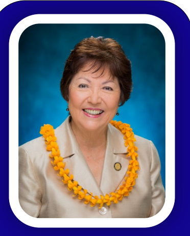
Senate Vice President

(D) Senate District 18 - Serving Mililani Town, Waipio Gentry, Waikele, Village Park, Royal Kunia