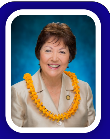
Senate Vice President

(D) Senate District 18 - Serving Mililani Town, Waipio Gentry, Waikele, Village Park, Royal Kunia