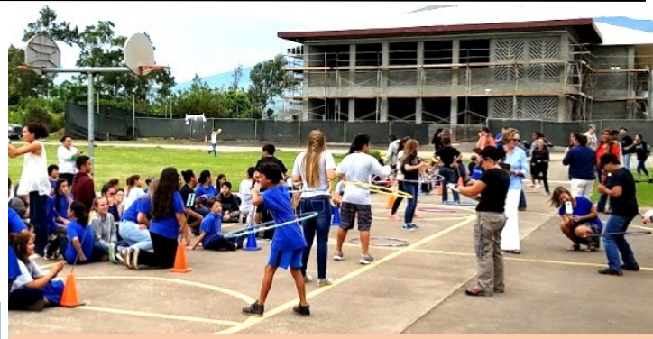
Waimea Middle School's still-under-construction $16 million, nineclassroom STEAM Building will be the largest structure in Waimea.

A pilot program was underway this year in Kohala schools to develop guides for Farm-to-School activities, including purchasing locally grown food and ingredients, modifying school lunch menus, kitchen staff training on scratch-cooking, minimizing food waste, and growing food for cafeteria use. The program will expand to all Hawaii Island schools, then to Maui, and eventually to Oahu campuses.