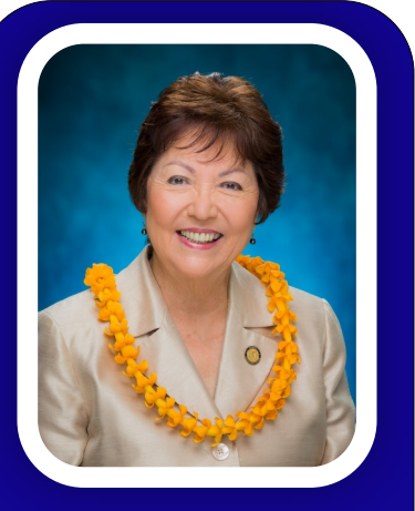
Senate Vice President

(D) Senate District 18 - Serving Mililani Town, Waipio Gentry, Waikele, Village Park, Royal Kunia