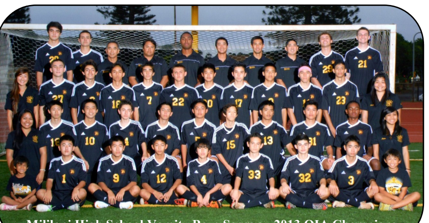
Mililani High School Varsity Boys Soccer—2013 OIA Champions

Both the girls and boys basketball teams advanced to post-season play in their respective tournaments and both teams made it into the quarterfinals.