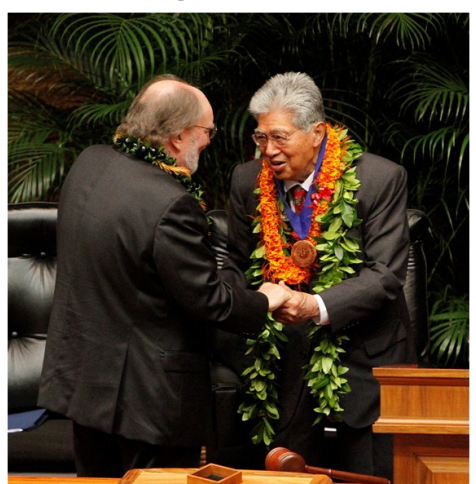
Governor Abercrombie presented the medal at a joint gathering of the State Senate and House of Representatives.

The State Legislature in 1993 created the Aloha Order of Merit to recognize those individuals who have served the state with distinction. First recipient is U.S. Senator Daniel K. Akaka. The medal (close up below) is made of koa wood and engraved for the specific recipient.