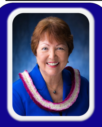
Senate Vice President

(D) Senate District 18 - Serving Mililani Town, Waipio Gentry, Waikele, Village Park, Royal Kunia