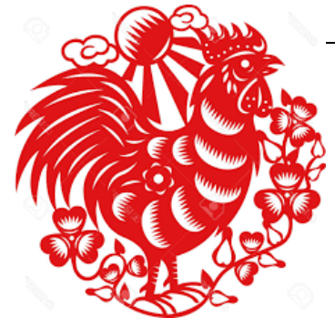
2017 - Venr of the Rooster