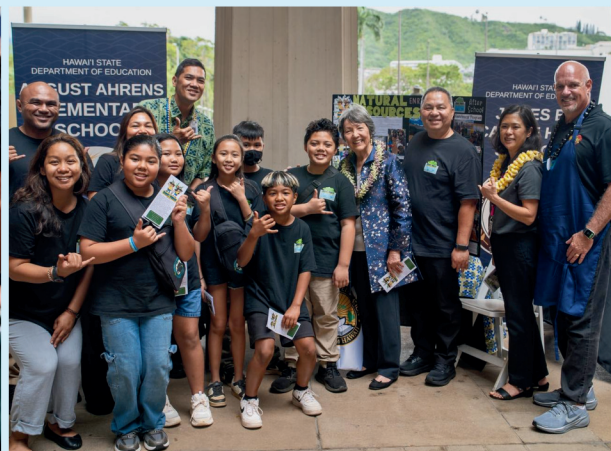
With DOE staff and students at this year's Student Showcase.