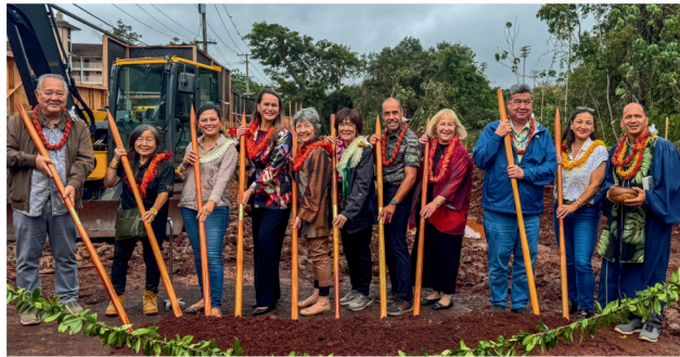
With fellow State Legislators, Community members, and DOE at the groundbreaking