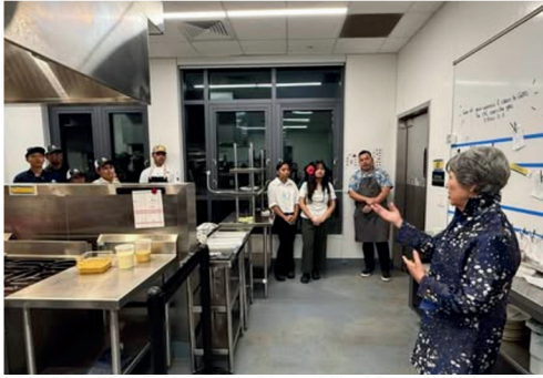
Thanking the students working at the Marauder Cafe for their hardwork!

An evening at Waipahu High School's student-run Marauder Café was a wonderful chance to experience how the Academy of Natural Resources and the culinary pathway in the Academy of Professional and Public Services come together to create a true farm-to-table learning environment. The students took charge of every part of the café, and their talent truly stood out. From the delicious food to the polished service, they carried themselves with confidence and pride, making the entire experience inspiring to watch. I am incredibly proud of their hard work and deeply appreciative of the educators who guide and support them along the way!