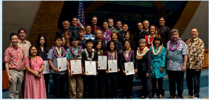
Members of the Senate with the winners of the 1st, 3rd and 4th place LifeSmarts Competition.