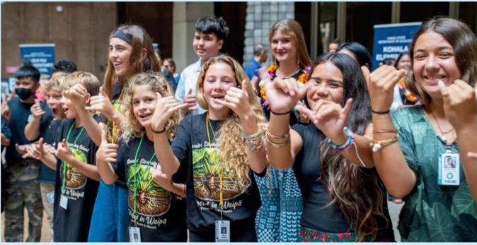
Students smile and shaka at our Student Showcase!