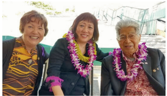
[L-R] Me, Former U.S. Congresswoman Colleen Hanabusa, and former U.S. Senator Daniel Akaka in 2017.