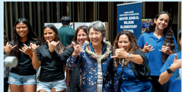
With students at the Student Showcase during Senate Education Week.