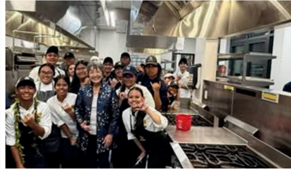
Me with the amazing students in the Public Services' Pathway!