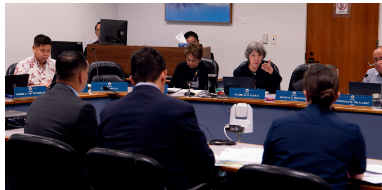
WAM Informational Briefing on January 8th with the Department of Law Enforcement

The 2026 legislative session is starting in motion! As a member of the Senate Ways and Means Committee, we have been attending a series of informational briefings with many state departments. These briefings provide an important opportunity for departments to present their budget requests for the upcoming biennium, allowing the Committee to thoroughly evaluate funding priorities. The informational briefings are being held from January 7 through January 20, 2026, and I remain committed to ensuring careful consideration of programs and initiatives that serve the needs of our community.