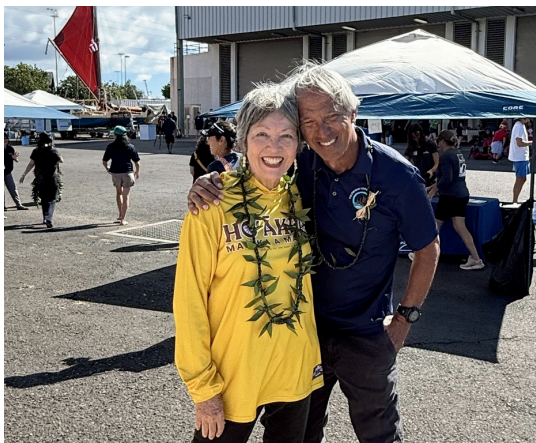
Me with Nainoa Thompson