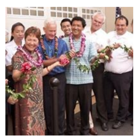
I joined Mayor Caldwell and City Council member Ron Menor (at left) at the official dedication for the long awaited Waipio EMS station.

Along Kam Highway, the new Waipio EMS ambulance station was dedicated last week. Emergency Medical Services are operated by the City & County of Honolulu, with funding provided by the State Department of Health. This is a project I initiated a decade ago when I was first elected to the Senate, and we are all pleased that the city has finally completed their work.