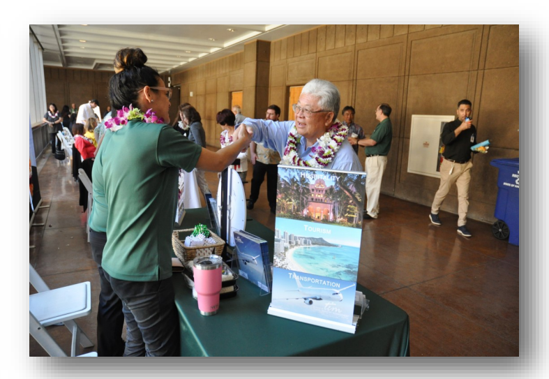
The annual Tourism Day at the Capitol had over 50 vendors from different avenues of tourism. They ranged from numerous hotels, tour companies, local products vendors and tourism associations across the Islands. As the Chair of the Tourism Committee it allows me to get involved with all these different groups to help tourism continue to flourish through out the state.