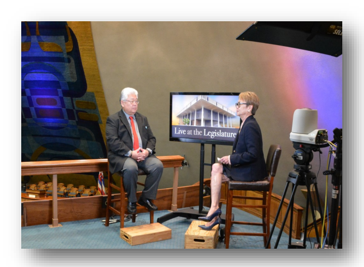
Rep . Onishi doing a live interview on Olelo Hawaii for "Live at the Legislature' discussing the hot topic of short term vacation rentals across the Islands.