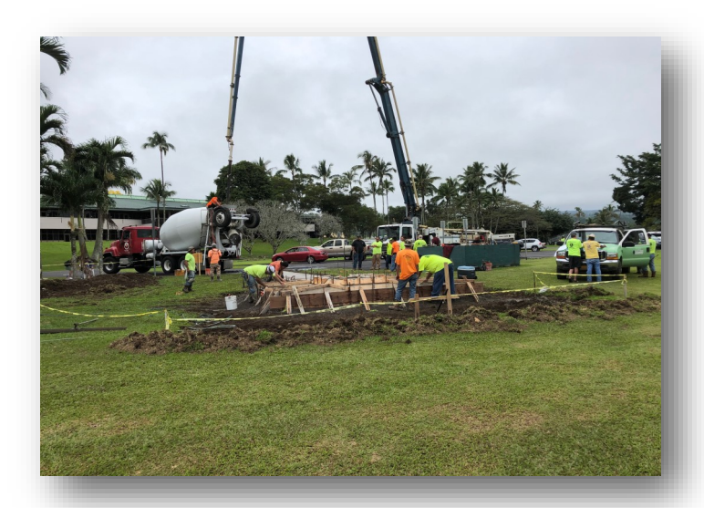
Rep attended the ground breaking of the Korean War Memorial located next to the Vietnam memorial in Wailoa State Park. This was a long process working with the County and the Korean War Veterans to get the perfect location and design of the memorial.