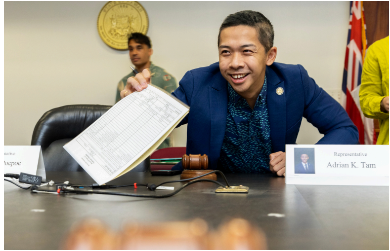
Getting bills signed