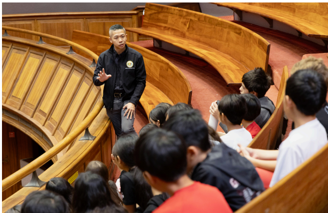
Meeting with students from Iolani School