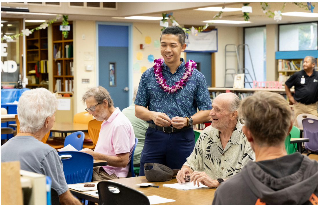
Rep. Tam hosting a Legislative Townhall for the community