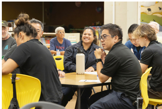
Waikiki District 6 police officers listened to concerns from residents in the area.