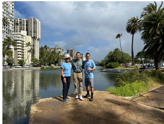
Rep Tam meeting with folks from the Genki Ala Wai Project. As of August 2024 165,991 Genki Balls have been made and deployed into the canal! Read more about it here: https://www.genkialawai.org/impact