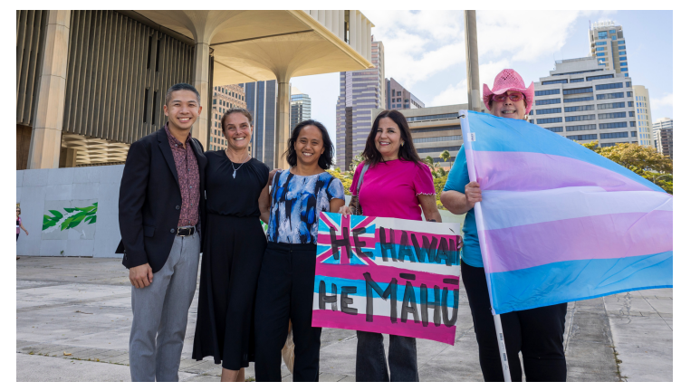
Sign waving for Transgender Day of Visibility at the State Capitol.