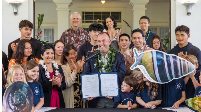
Signing of the Snail Bill with student advocates who helped pushed this bill through