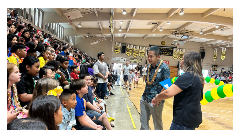
34th Annual Texaco Honolulu District Elementary Speech Festival