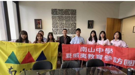
Nan-Shang High School Students visit the Hawaii State Capitol and learn about US Government.