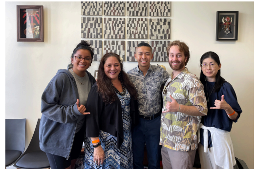
With HPU Master of Social work students visiting the Capitol and discussing policy.