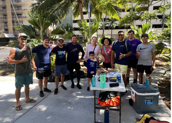
Community members at Centennial Park for a District Community Clean up. Mahalo to all who volunteered!