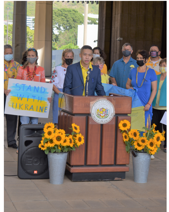
We stand with the people of Ukraine. Slava Ukraine!