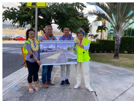
Proposed Kolowalu Park Pedestrian Refuge Island and

Mahalo to all of you who have written, called, or emailed our office or the DoT and HCDA about the dangerous (lack of) a crosswalk between Queen and Waimanu Streets in Kakaako. Finally the crosswalk will be repainted, and a pedestrian refuge center will also be installed, allowing for safer access to those who need to cross the street.