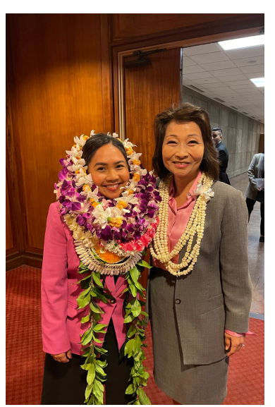
Lt. Governor Sylvia Luke on Opening Day

Looking for information on the Legislative process? The Legislative website: www.Capitol.Hawaii.Gov is a great place to start! For more hands-on help visit or contact the Public Access Room, they are located at the State Capitol room, 401. Visit their website: www.Irbhawaii.ord/par or call (808) 587-0478