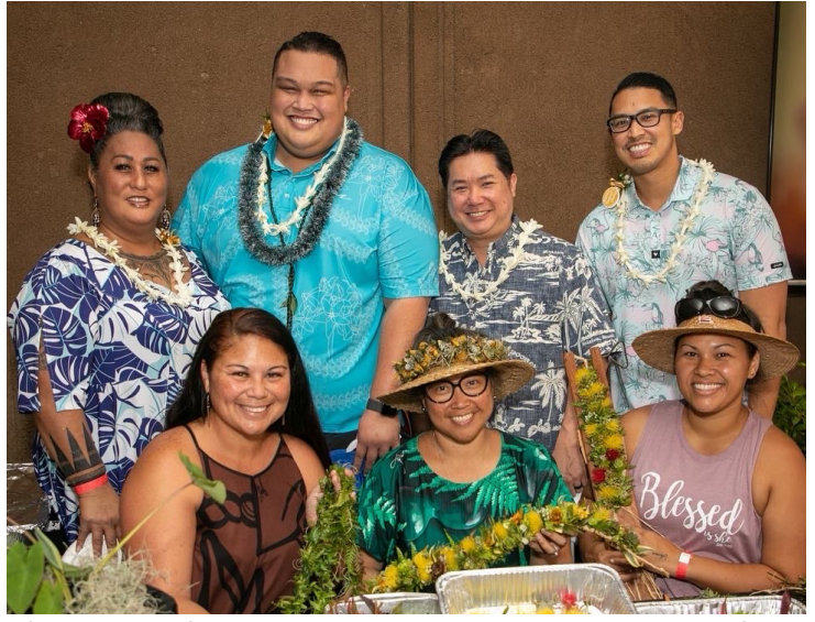
Celebrating and Supporting Local Agriculture with Agriculture Day at the State Capitol.