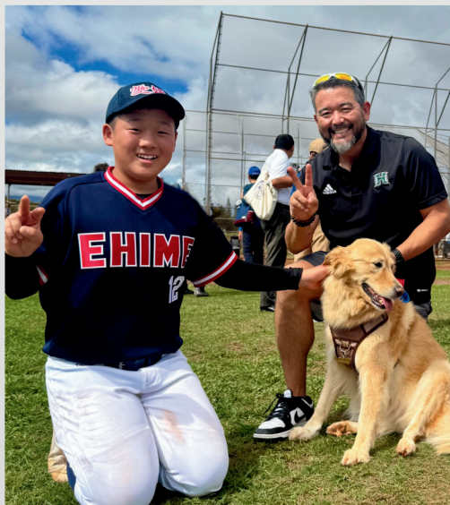
Ehime-Hawaii Sister-State Goodwill Baseball Tournament