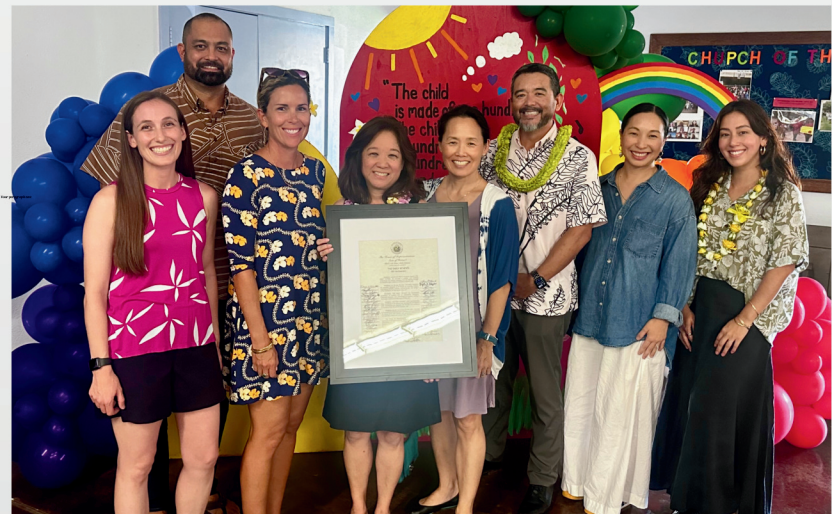
50 th Anniversary of The Early School