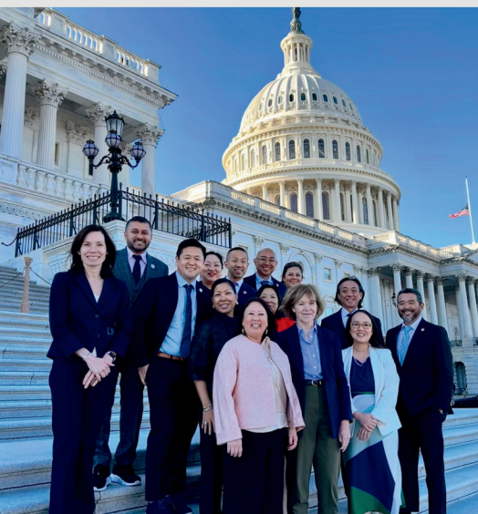
Advocacy with fellow AANHPI legislators in Washington, D.C.