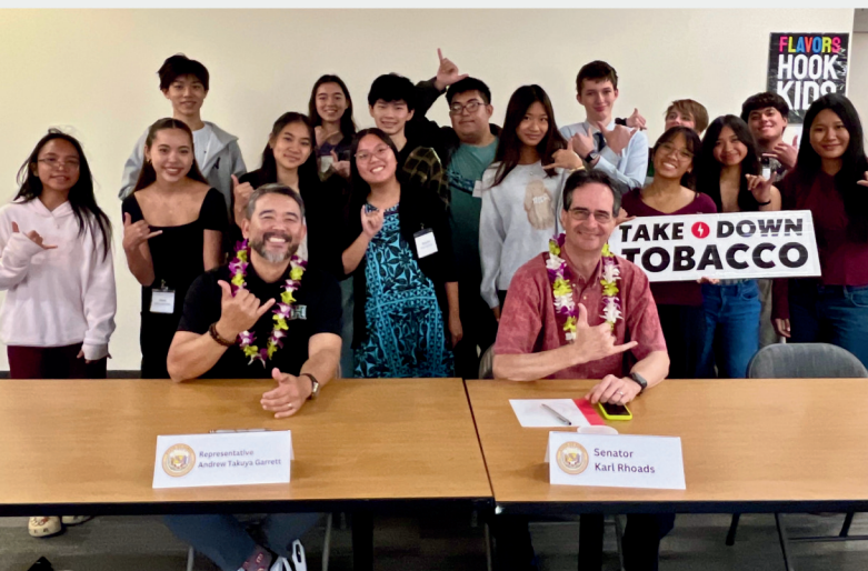
Coalition for a Tobacco-Free Hawaii Youth Council