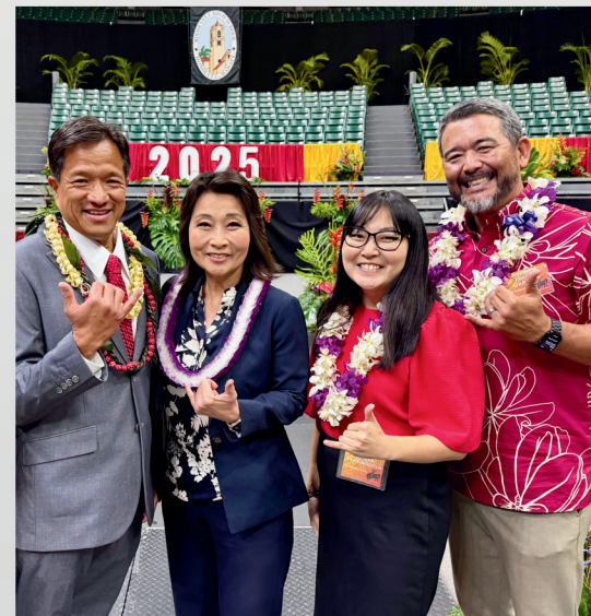
Roosevelt High School Class of 2025 Graduation Ceremony