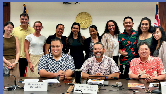
Top: Partnering with University Lab School students for neighborhood graffiti removal