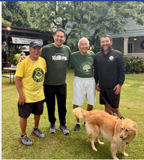
Mālama Mānoa and The Outdoor Circle's 1,000 Tree Giveaway