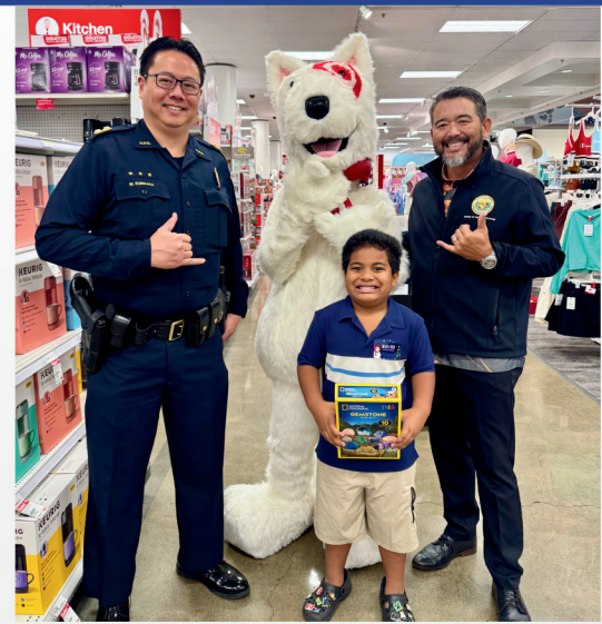
"Heroes and Helpers" Christmas Shopping Event