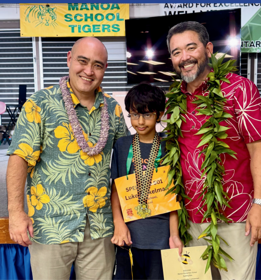
Mānoa Elementary School's first-ever Spelling Bee

Listening and showing up (often with Rhea!) is central to how I serve