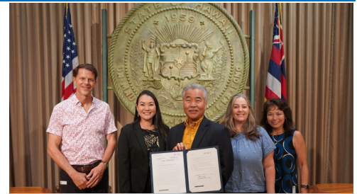
Bill Signing Ceremony for Cesspool Grant Program