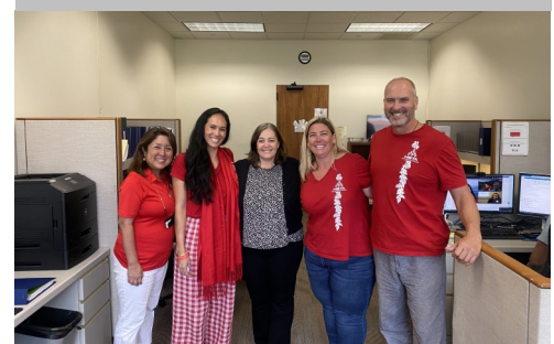
Visiting with West Hawaii Teachers