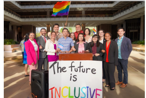
Attending the “Lead with Love” Rally