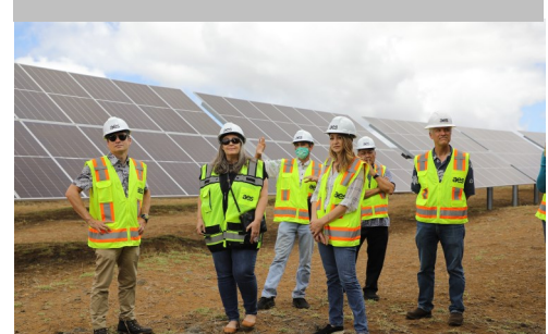
Site Visit to Waikoloa Solar Project