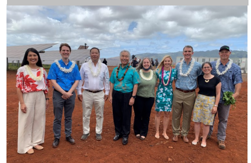
Renewable Energy Project Blessing