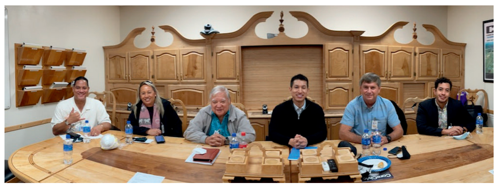
Senator DeCoite on the Public Safety, Intergovernmental, and Military Affairs Committee site visit to Saguaro Prison in Arizona.