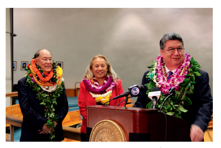
Senator DeCoite participating in the Senate Leadership Press Conference on Sine Die. (Last day of the Legislative Session)