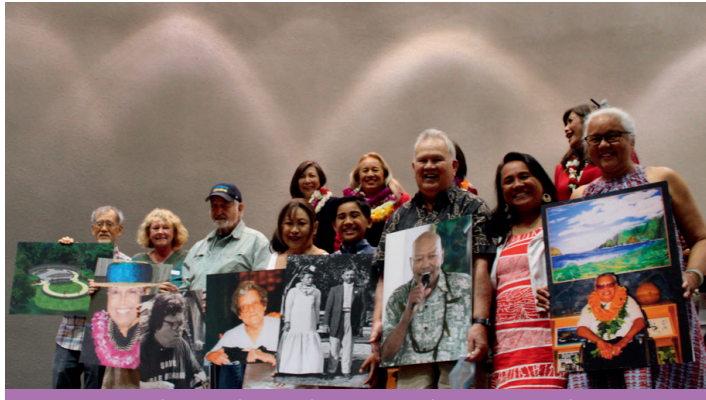
Members of Ka 'Ohana O Kalaupapa in the Senate Chamber after the passage of SB 3338.

Requires the department of health to implement a telehealth pilot project and publish an evaluation report on the telehealth pilot project outcomes. Requires the department to implement and administer a rural health care pilot project to provide physicians and nurse practitioners serving selected rural areas with an availability fee and reimbursements for certain expenses and submit to the legislature an evaluation report on the rural health care pilot project outcomes. Appropriates funds to support the pilot projects.