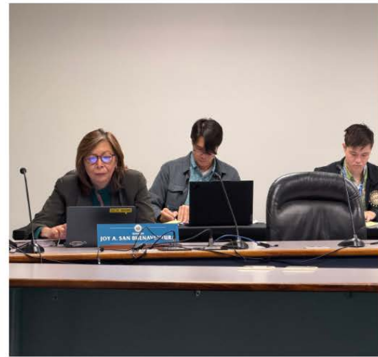
On March 17th the Senate Committee on Judiciary began hearing House bills that crossed to the Senate. On this day the committee passed bills relating to Discrimination, Family Courts & Child Welfare, Domestic Abuse, Temporary Restraining Orders, Elections, and Criminal Proceedings. On this day, the committee also voted to advise & consent to the nomination of Lani Ewart for the Commission to Promote Uniform Legislation.