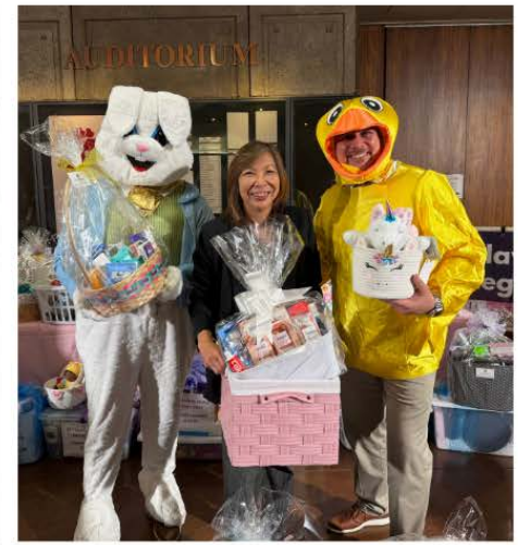
My staff and I prepared donations baskets for the Hawaii Women's Legislative Caucus 2026 Easter Basket Drive.