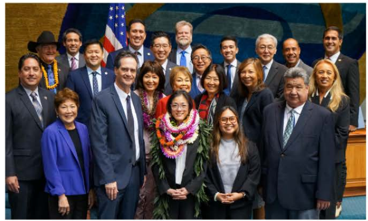
The Senate recently confirmed Governor's Nominee, Stephanie S. Char for Circuit Court Judge of the Circuit Court of the Fifth Circuit (Island of Kaua'i).