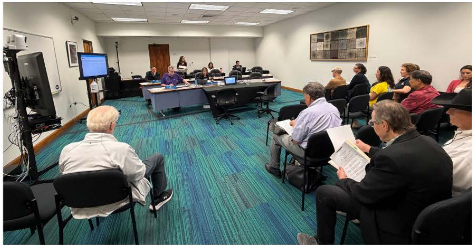
SCR21 -Requesting the Hawaii Health Systems Corporation's East Hawaii Regional Health Care System to conduct a feasibility study on establishing a rural health clinic or comparable rural health access point to serve the Volcano Community. I am very supportive of SCR21 and I am grateful for everyone who provided written testimony in support of this measure. The Senate Committee on Health & Human Services voted to pass SCR21 with none of the members voting no or with reservations. The measure will now be brought before the full Senate where it is expected to pass and be transmitted to the House