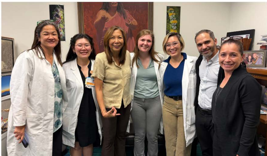
Discussing legislation with the Hawaii chapter of the American College of Obstetricians and Gynecologists (ACOG). ACOG represents local obstetrician-gynecologists, offering professional development, advocacy, and resources for women's health.