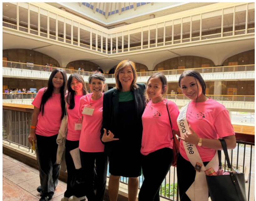
With student advocates who traveled all the way to the state capitol from the Big Island to participate in Take Down Tobacco Day 2026.