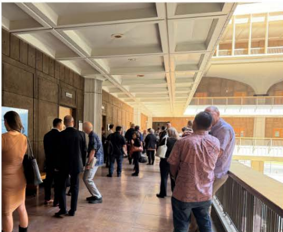
Joy San Buenaventura

A stylized, handwritten signature in black ink, appearing to read "Joy San Buenaventura".