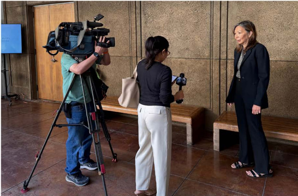
Speaking with KHON2 News following the joint WAM/HHS Informational Briefing.

I was honored to have recently been given the "Legislator of the Year" award by the Hawaii Dental Association. As Chair of the Senate Committee on Health & Human Services, I understand the importance of dental health and the urgent need to ensure that low-income families with children have access to care. In 2022, I introduced legislation to reinstate adult dental benefits for Medicaid enrollees and due to the overwhelming support for my bill, the legislature actually ended up inserting funding for adult dental benefits into the budget.