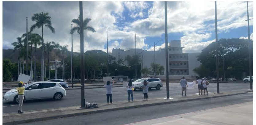
I recently helped with the Hawaii Fetal Alcohol Spectrum Disorder (FASD) Action Group's awareness rally at the state capitol. In 2023, I introduced SB318, relating to FASD. Individuals who are prenatally exposed to alcohol may develop lifelong physical, developmental, behavioral, and intellectual conditions, which are diagnosed as fetal alcohol spectrum disorders (FASDs). While individuals with FASDs share many of the same behavioral characteristics and related mental health diagnoses as those with autism spectrum disorders, individuals with FASDs face unique challenges. SB318 established a pilot program to determine the feasibility of implementing a co-management system of care to support individuals with FASDs.