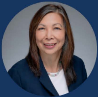
SENATOR JOY SAN BUENAVENTURA

UPDATE ON HIGHWAY 130 PROJECTS FROM DEPT. OF TRANSPORTATION DIRECTOR ED SNIFFEN