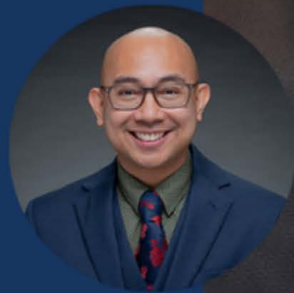
REPRESENTATIVE GREGOR ILAGAN